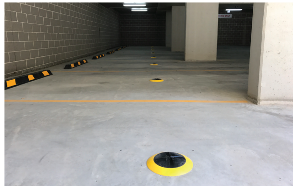
Col. Jones Swim Fitness, Hurstville Improving the safety of the parking experience for swimming centre patrons and staff.