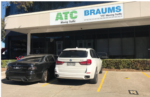
ATC/BRAUMS HQ, Rydalmere Monitoring staff parking at ATC/BRAUMS Headquarters.